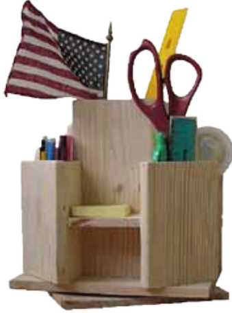
Rotating Desktop Organizer

360° rotation with 5 compartments, including a large deep one in the center, optional shelf for note pads and optional screw for holding tape.